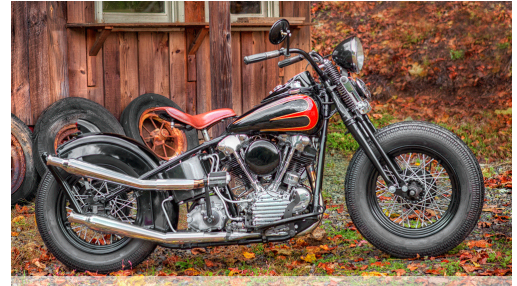
You can win this 1939 Harley-Davidson "EL" Knucklehead Bobber